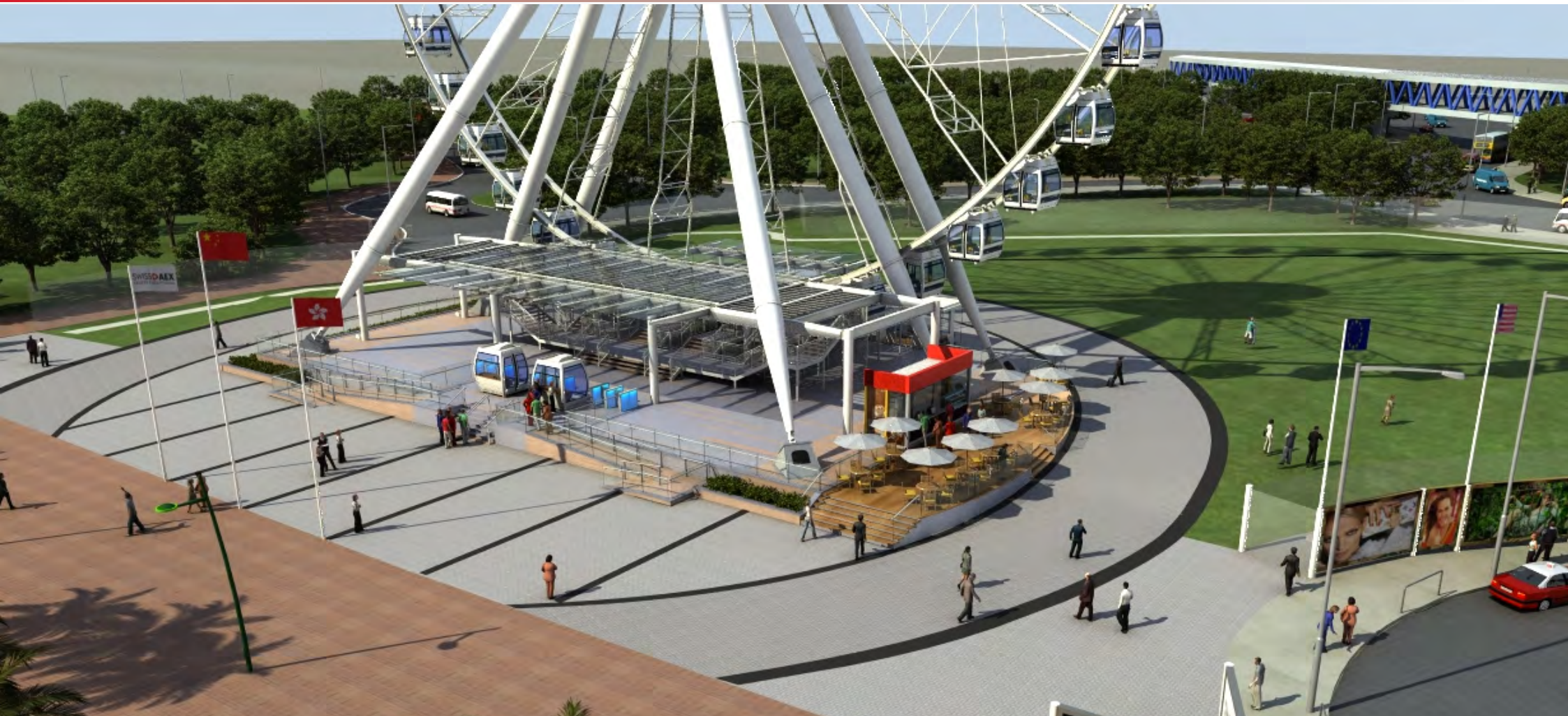
Rendering of daytime