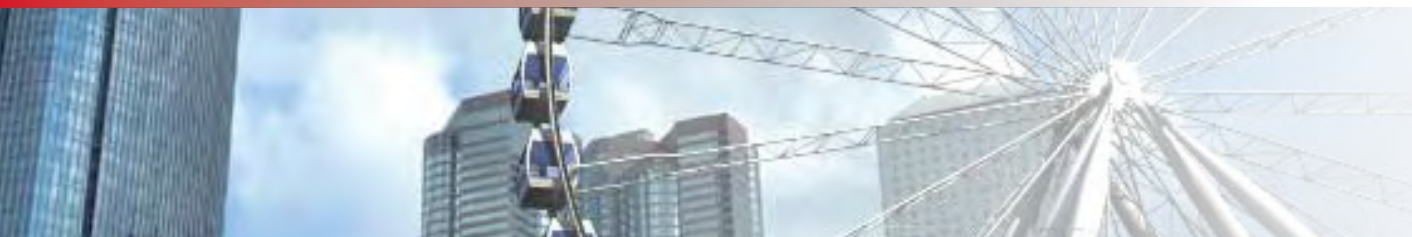
Hong Kong Observation Wheel Project