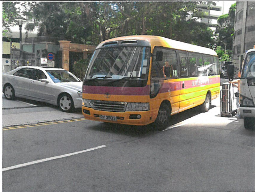
Photo 3 & 4: Illegal parking poses potential danger to road users.