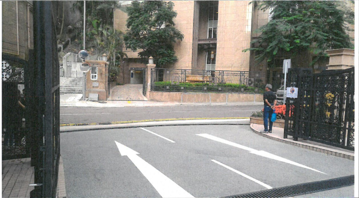
Photo 2: Our Entrance is right opposite the entrance of Velerade, 11 May Road