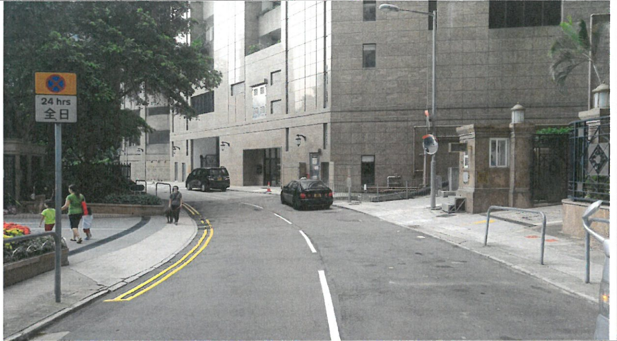
Photo 1 : The 3.4M road (south bond)cannot accommodate heavy traffic