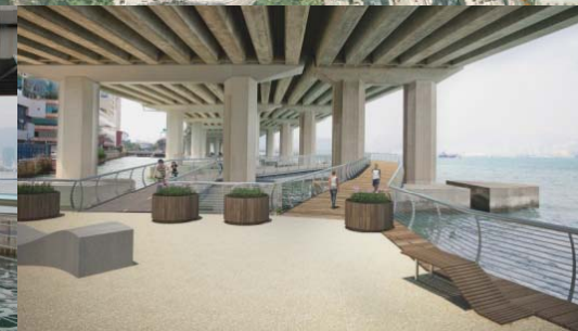
Artist's Impression at Hoi Yu Street Access Point