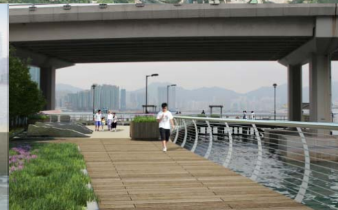
Artist's Impression at Tong Shui Road