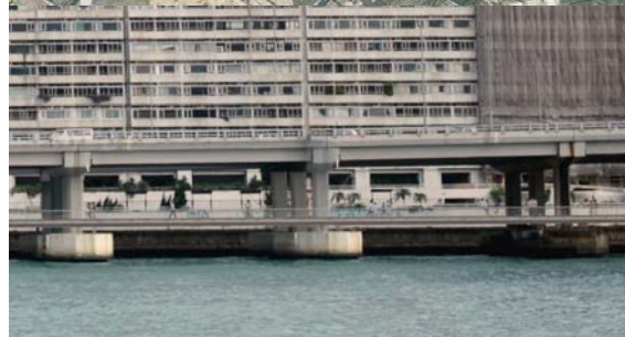
Artist's Impression near Provident Centre