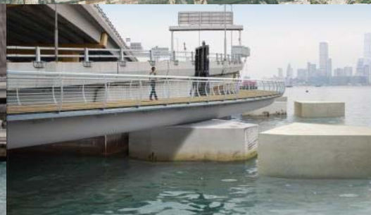
Artist's Impression near Tong Shui Road Pier