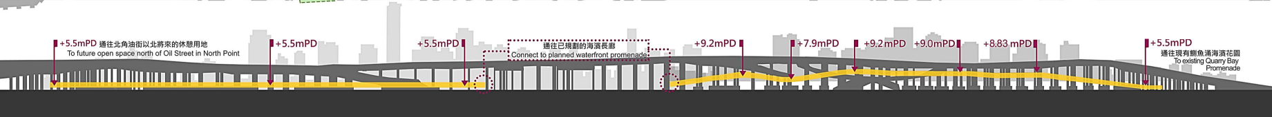
行人板道立面圖 BOARDWALK ELEVATION (只作參考) (for reference only)