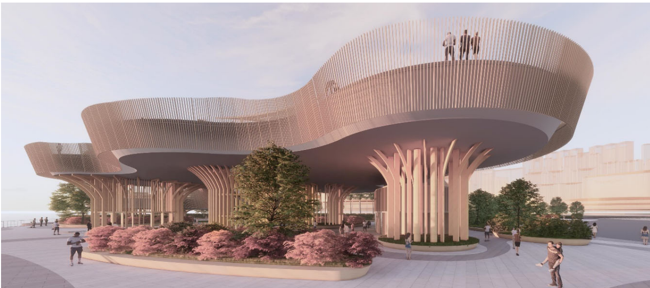
1. 擬建海濱觀景台 PROPOSED WATERFRONT PAVILION