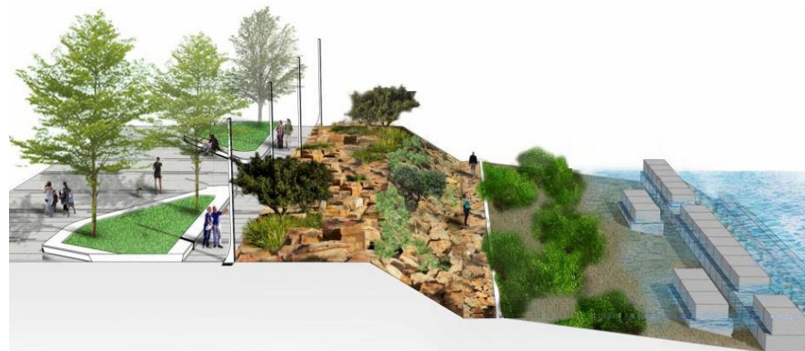
3. 擬建海濱長廊 PROPOSED WATERFRONT PROMENADE