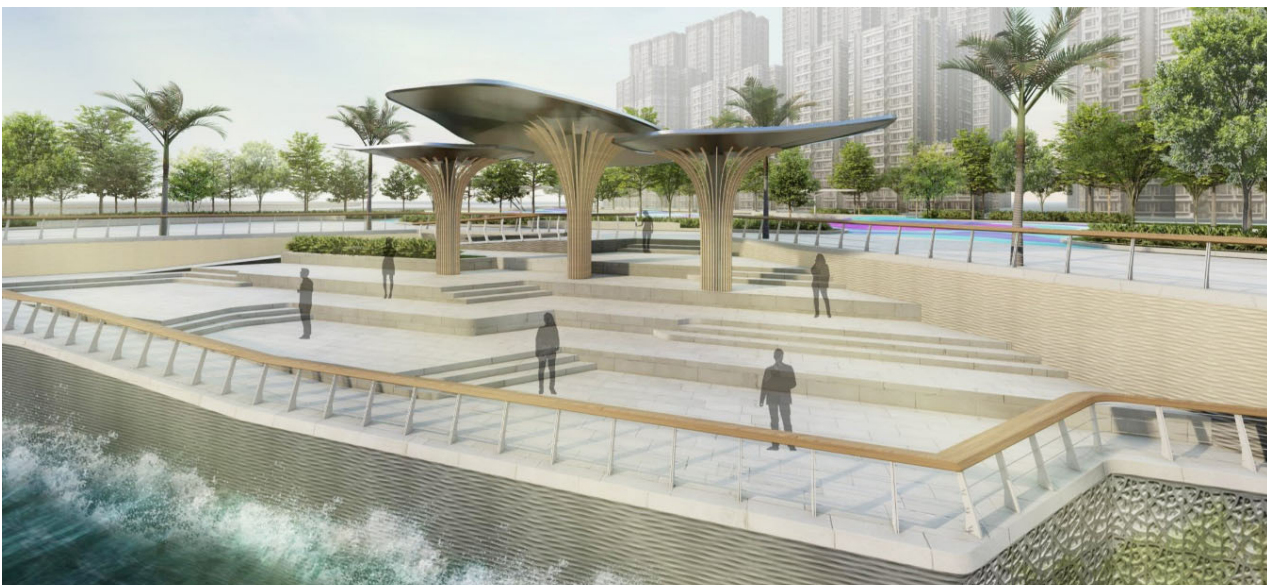
2. 擬建海濱觀景廊 PROPOSED VIEWING GALLERY

註：圖片只供參考 Note: Photos for reference only