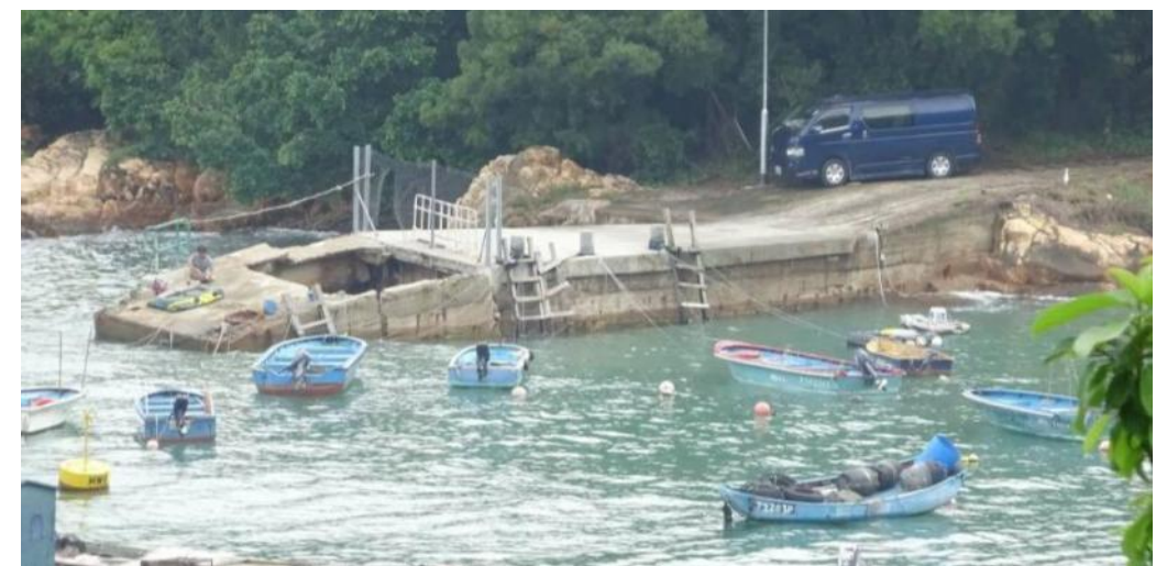
馬灣石仔灣(由村民自行興建) Ma Wan Shek Tsai Wan (built by local villagers)