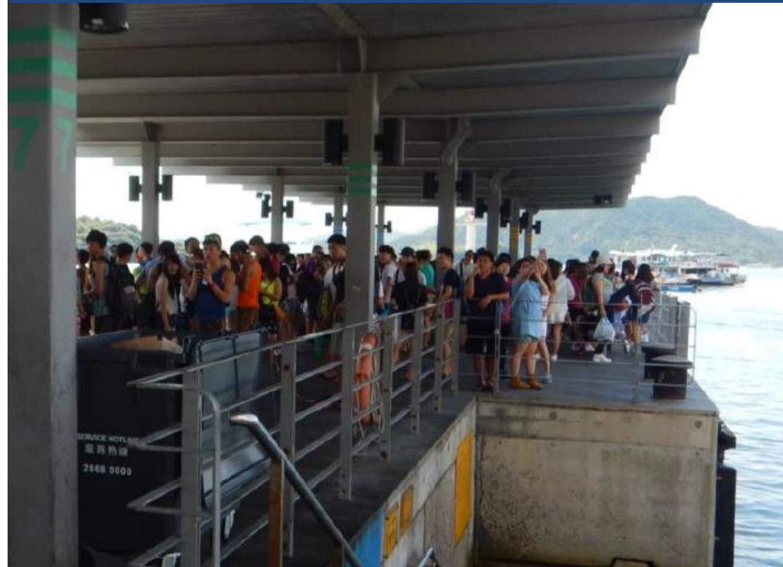
西貢碼頭 Sai Kung Pier