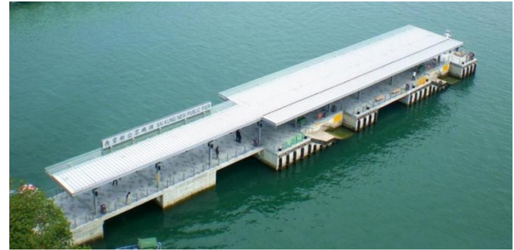
西貢新公眾碼頭 Sai Kung New Public Pier