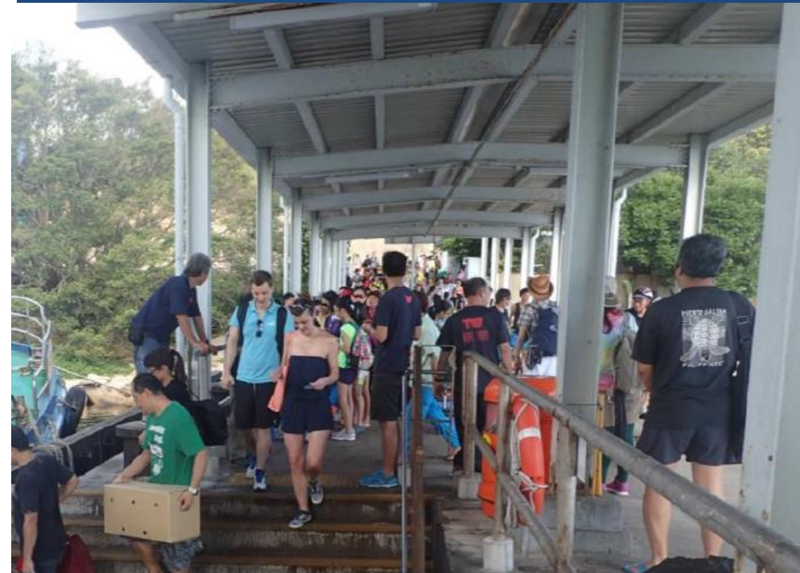
馬料水碼頭 Ma Liu Shui Pier