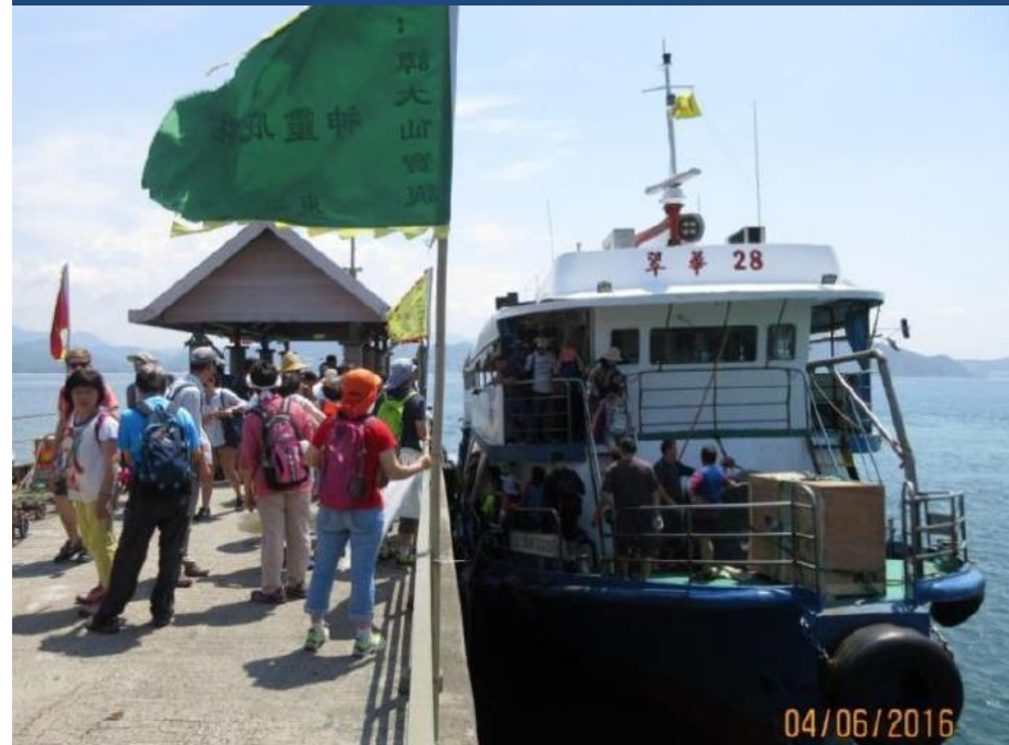
大埔東平洲 Tung Ping Chau, Tai Po