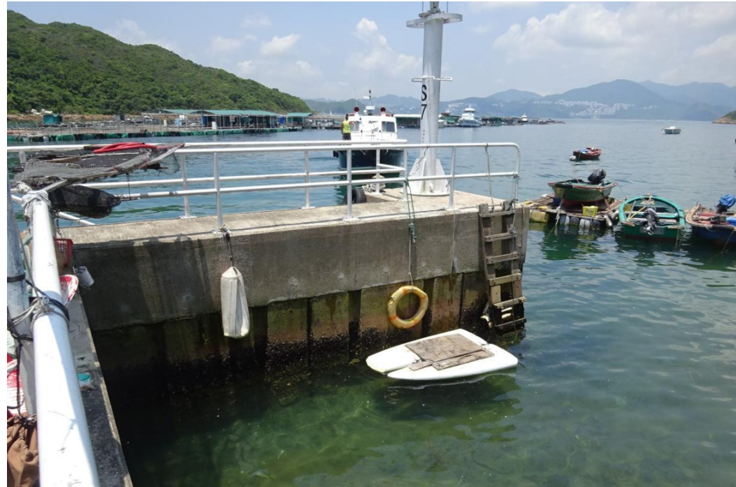
滘西村碼頭 Kau Sai Village Pier