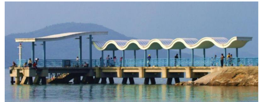
烏溪沙碼頭 Wu Kai Sha Pier