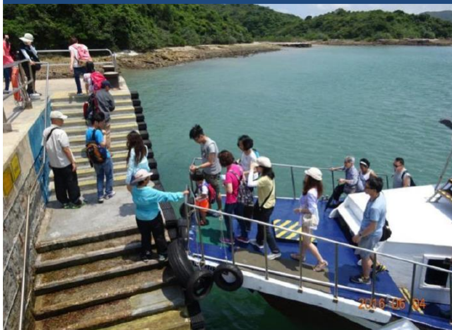
西貢鹽田梓 Yim Tin Tsai, Sai Kung