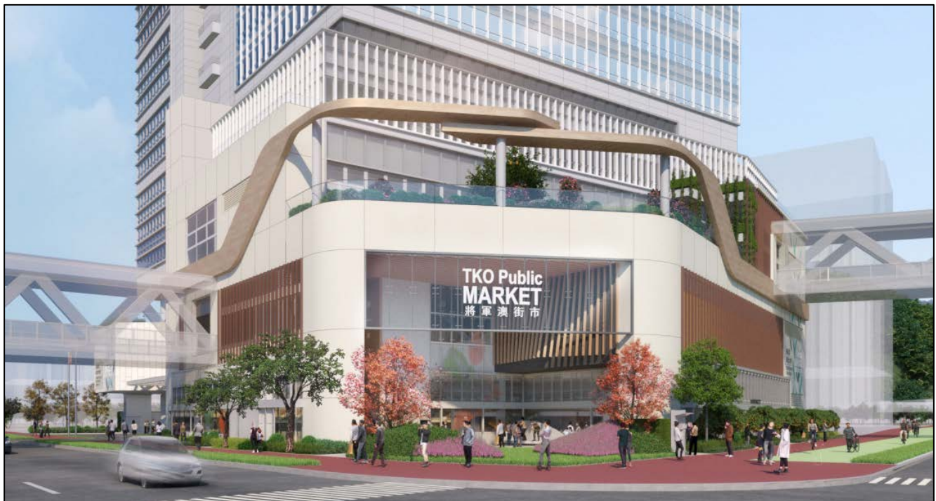
Photomontage of the Footbridges