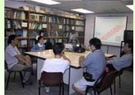
小組輔導情況 Group counselling