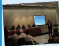
公眾諮詢會 Public Forum