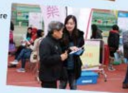
問卷調查 Questionnaire Survey

歡迎瀏覽以下網址了解更多有關此項目的資料。如有查詢，請致電2158 5414 / 2158 5388，並可透過郵寄、傳真或電郵方式表達意見。