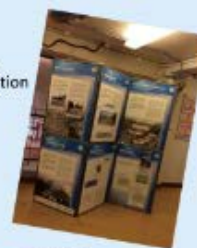
巡迴展覽 Roving Exhibition