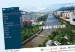
沙田區社區重點項目計劃專題網頁 Dedicated Website of the Signature Project Scheme in Sha Tin

The Sha Tin District Council has finalised the scope of the two projects under the Signature Project Scheme after going through stages of discussion, option selection and focus setting, with the Hong Kong Institution of Engineers, the Hong Kong Institute of Architects and the Chinese University of Hong Kong being appointed as honorary consultants. The public engagement exercise was held in two stages. The Sha Tin District Council produced various kinds of publicity materials and conducted questionnaire surveys, with a view to further enhancing public understanding of the projects and collecting public views on the design.